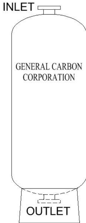
24" Through 48" Diameter

All liquid phase adsorbers work better if they are backwashed periodically. This “fluffs” up the bed removing fines and channeling flows. Additional maintenance that FRP-Series adsorbers require is the testing of effluent quality, and the checking of the operating pressure of the system. Monitoring the contaminant level into the last unit in a series arrangement is the recommended safeguard against having breakthrough in the final outflow.